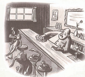
"C'mon fellas, it's too early—he ain't in yet."

An excerpt from "A Rabbit Walks into a Bar: Best Jokes & Cartoons from AA Grapevine"